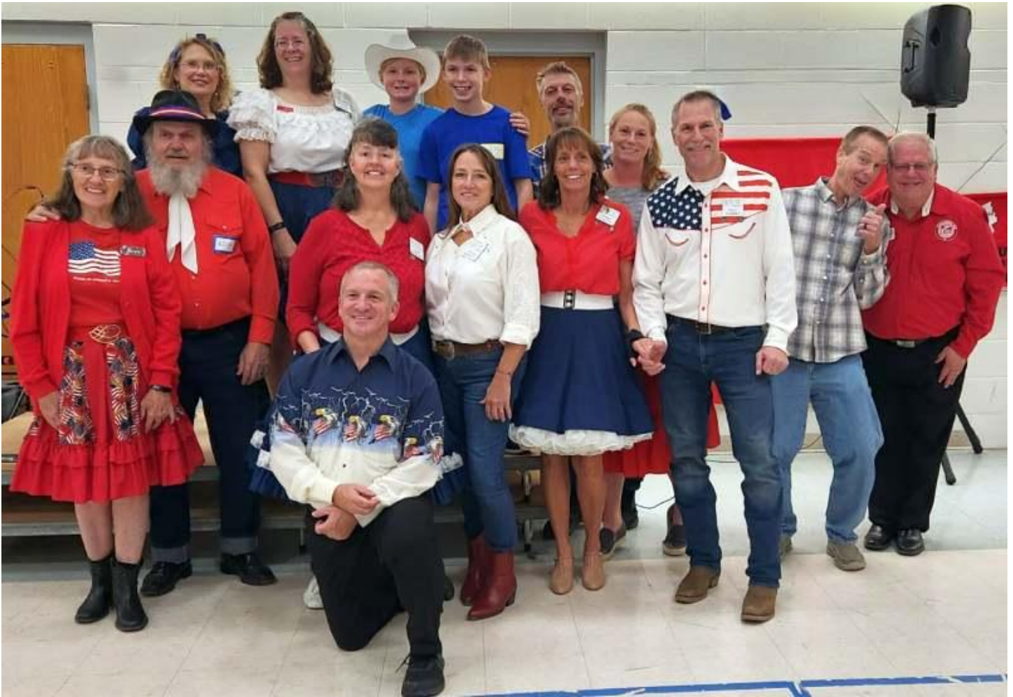
County Line steals a Hotfoot banner