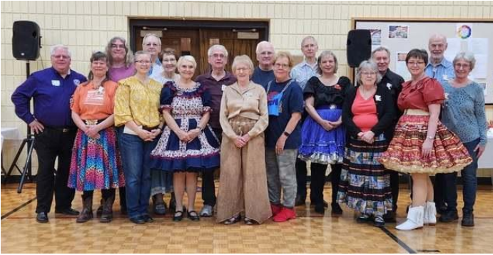
Hotfoot retrieves Super banner at Dan'sPac 11-4-23