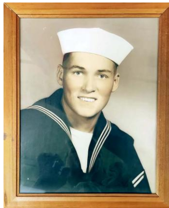
Hmmm – see any resemblance?