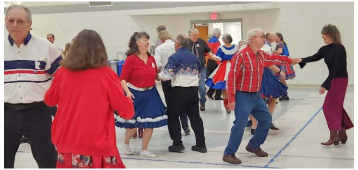
Square Dancing at Faith Lutheran Church