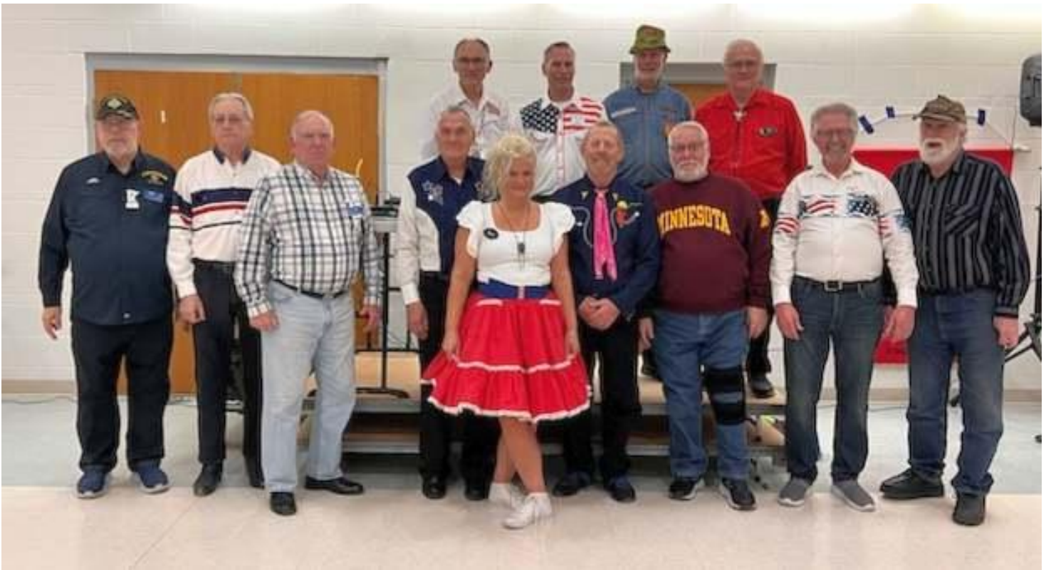
Veterans at our November 11 th dance