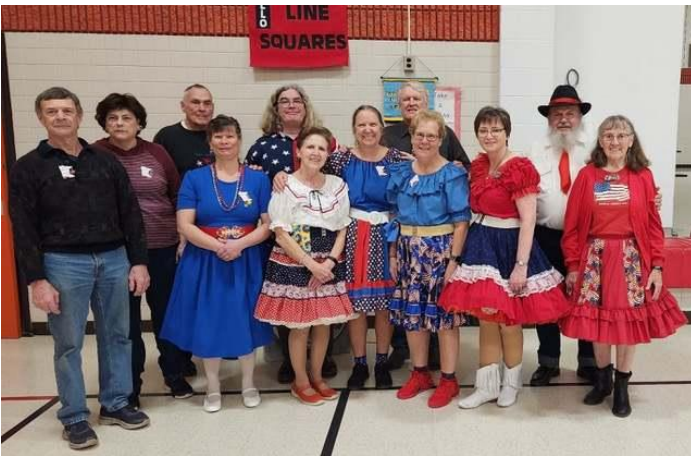
Hotfoot earns a banner from County Line 11-10-23