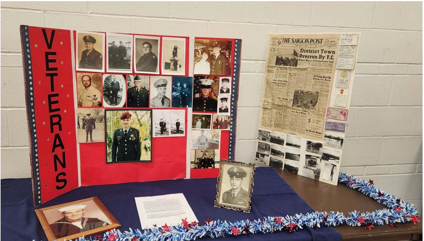
Thanks to Peggy Decker for organizing the veteran theme dance display