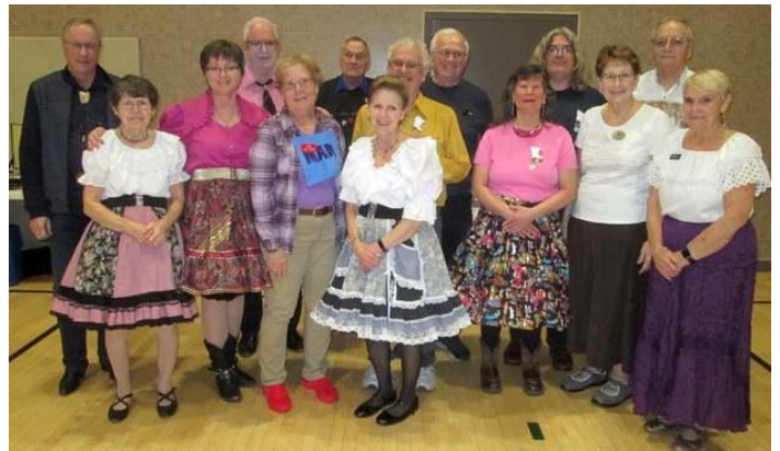
Hotfoot at Gospel PLUS 11-24-23