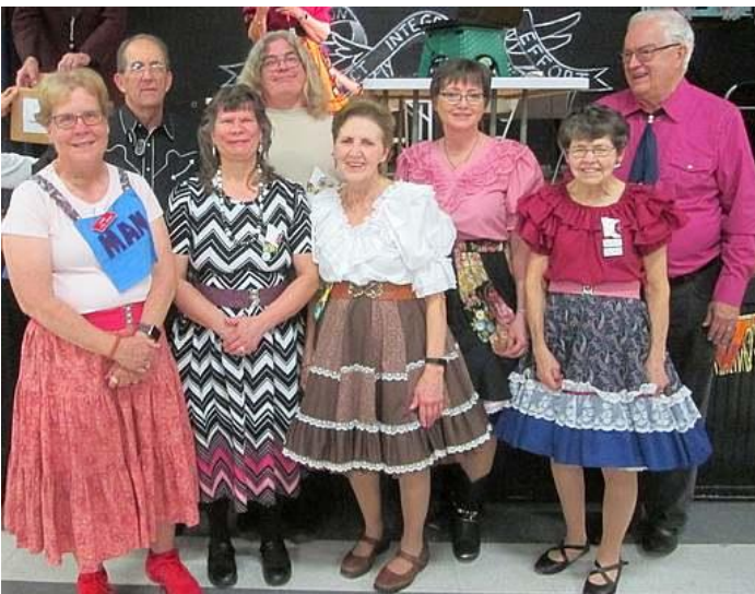
Hotfoot retrieves banner from Westonka 11-18-23